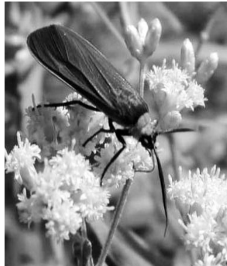
A yellow-collared scape moth on a goldenrod. Active during the day, scape moths are commonly called wasp moths due to their orange collar and iridescent wings.