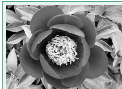
The Gifford Garden Stop by and see what's blooming!

I hope to continue developing ways to catalog natural history records and share my IES trail insights. My trail reports are currently being used to enhance trail information, such as the newly revised Wappinger Creek Winter Trail Guide, which will be available on-line later this fall. In the future, it would be great to increase on-trail interpretation in areas that have unique attributes, such as migratory bird activity or native wild flowers. ●