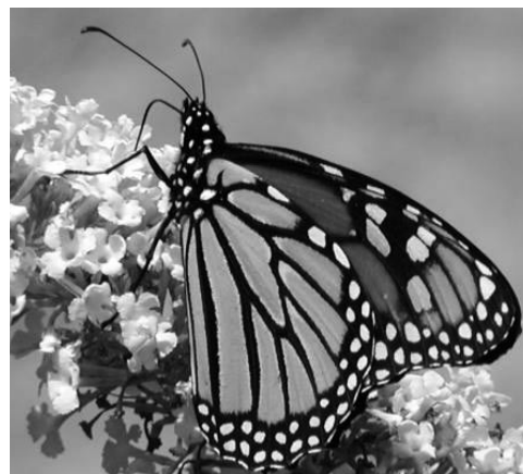
A monarch butterfly feeding on a butterfly bush. Eastern monarchs are long-distance migrants; many populations overwinter in Mexico.

I've always had a fondness for moths and butterflies. My trip was eco-tourism based; the first thing I encountered was an illuminated bed sheet covered in moths as big as my hand. Standing next to the sheet was a world-traveling lepidopterist who would become my companion for the next ten days. For the first time, I had a mentor that was eager to share a wealth of butterfly knowledge with me. When I returned home, I found myself looking at the landscape differently. I wanted to know more about the birds, plants, and insects that had always been living right in my backyard.