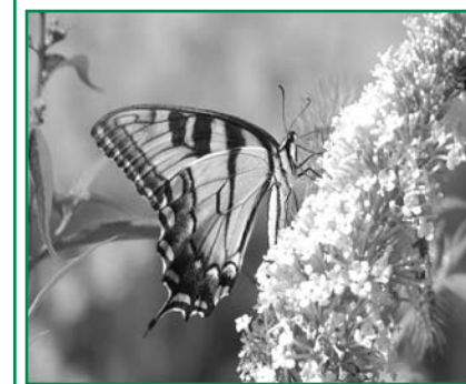
An eastern tiger swallowtail ( papilio glaucus ) in the Gifford Garden.