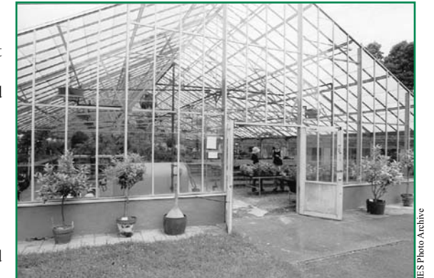
Replacing the greenhouse panels is just one step in the Institute's greening plan. Updating the greenhouse will reduce heating expenses by up to fifty percent!

For over two decades, the Institute of Ecosystem Studies has been generating important research about how ecosystems function. From understanding how acid rain is formed to monitoring the biological health of the Hudson River, IES research provides a scientific foundation for environmental conservation efforts—both locally and globally. In many cases, maintaining the Earth's ecological vitality depends on people treading more lightly and using resources more wisely.