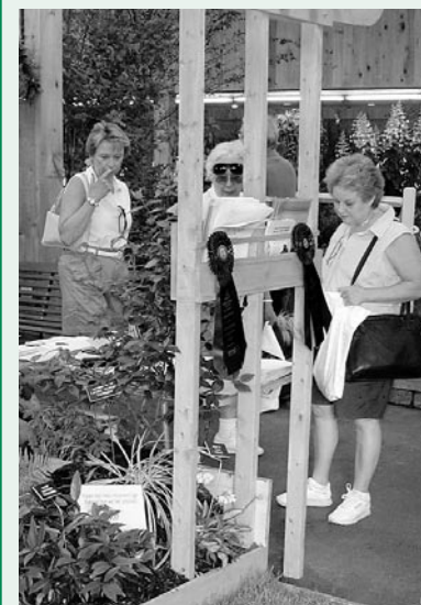
Thousands of fair attendees visited the Institute's exhibit on environmentally friendly gardening and landscaping.